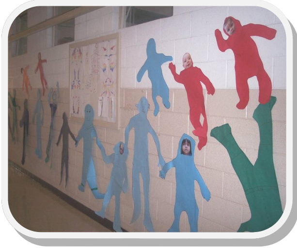
In 2010-2011 over 400 people participated in Wilkes Family Central.

Wilkes Community College (Continuing Education, Career Readiness), Department of Social Services, Goodwill, Legal Aide, Wilkes Literacy, Child Abuse Prevention Team, HOLA, St Paul's Crisis Assistance, Recovery Education Center, Cooperative Extension, Probation and Parole.