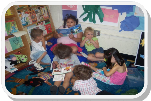
4, 473 books were given to children through the Reach Out and Read Program.

Wilkes County has been involved in a federal initiative called Reach Out and Read for over 10 years. Each year thousands of children receive a free book when visiting the doctor for a well check. Wilkes County has received national attention for its ability to connect families and reading through Reach Out and Read.